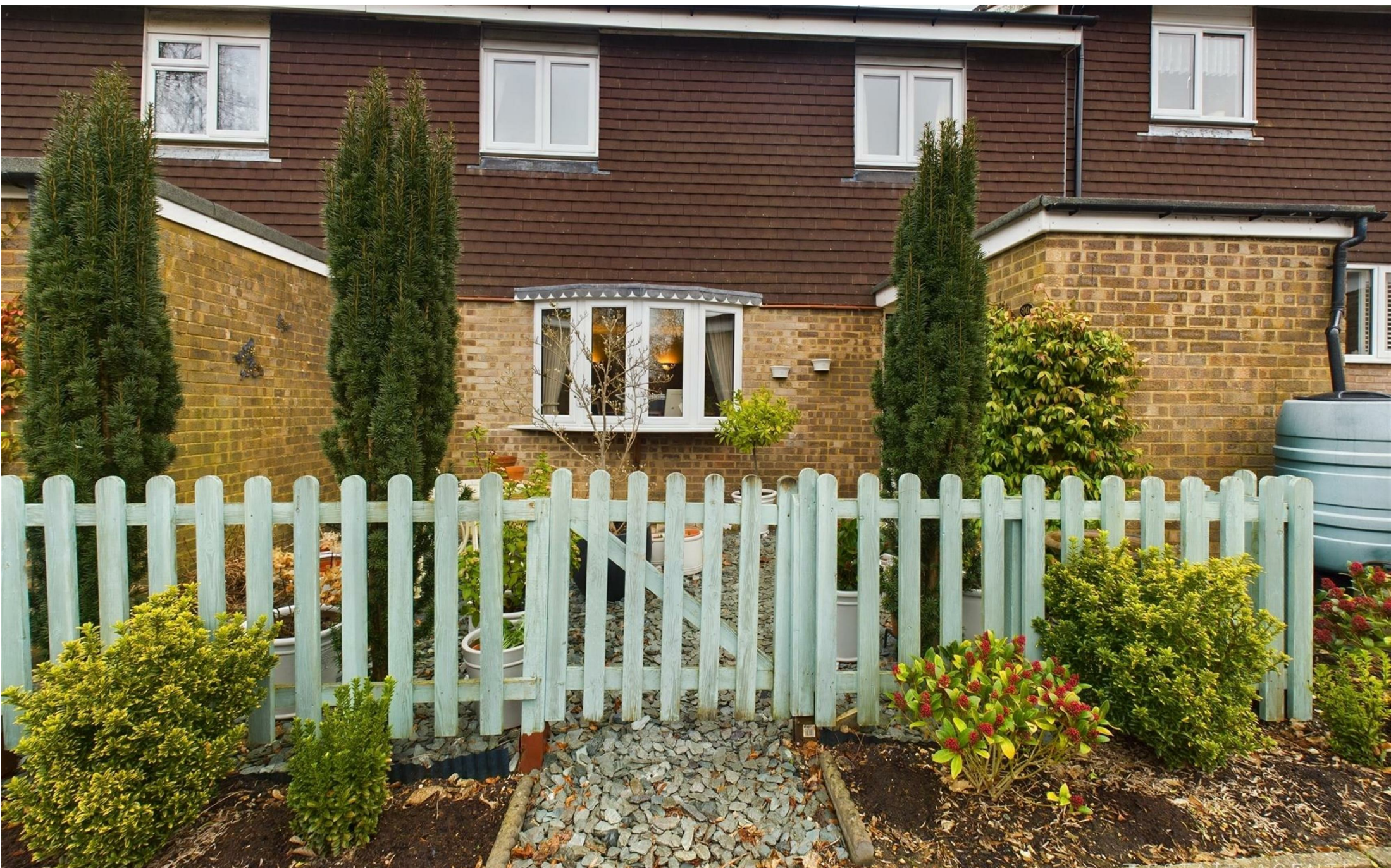
Whistler Close, Black Dam, Basingstoke, RG21 3HN